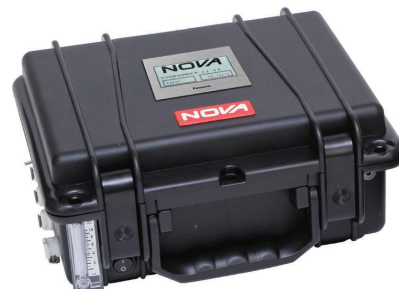
207KX - suitcase enclosure with external display (KX)