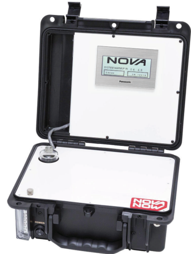
207K - standard suitcase enclosure (K)